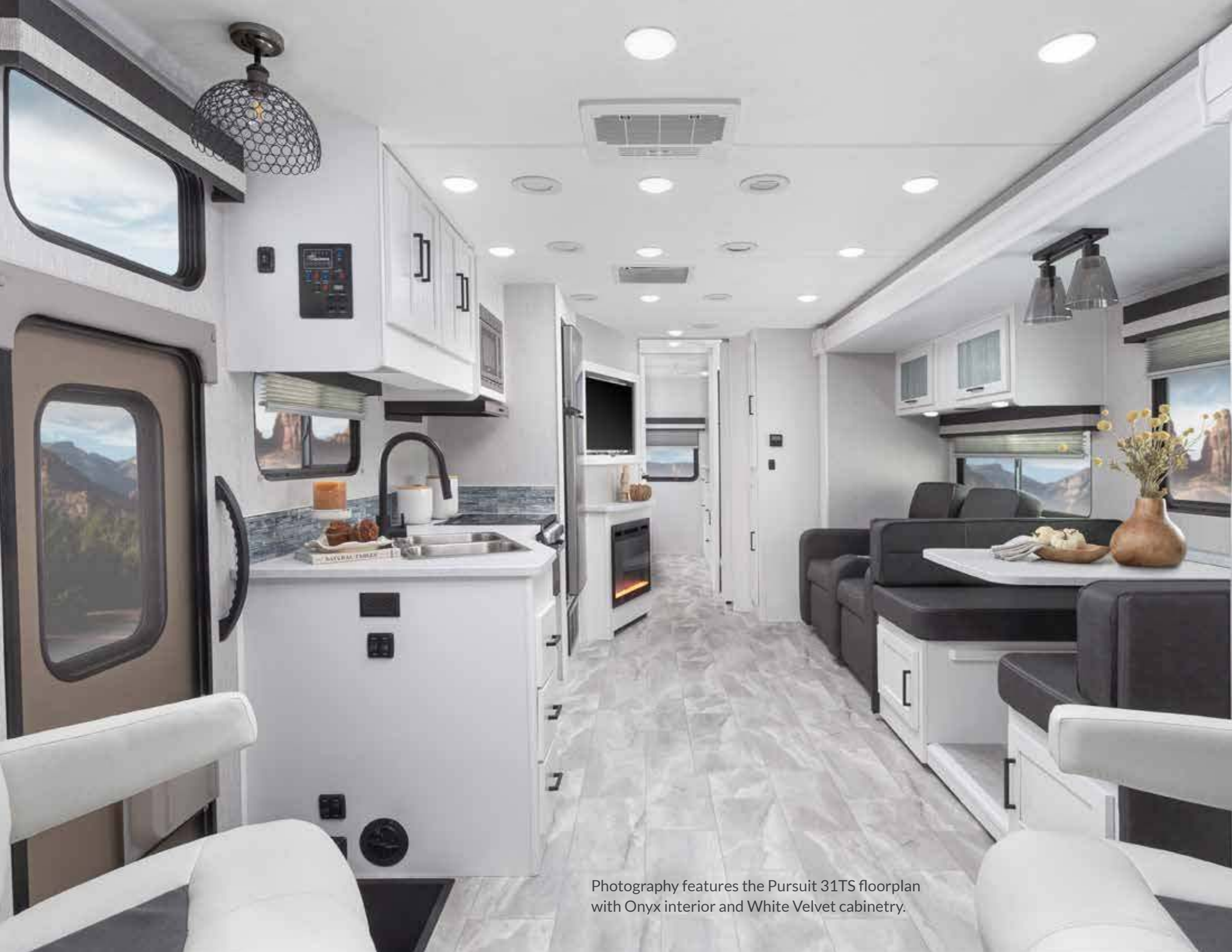
Photography features the Pursuit 31TS floorplan with Onyx interior and White Velvet cabinetry.